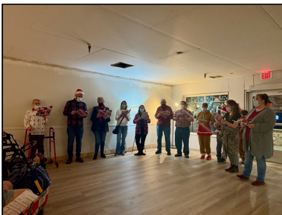
Christmas Caroling at Rosewood Villa

We have needs in Worship. We need volunteers to help with our weekly Live Stream offering and regular lectors and ushers to sign up to welcome people into worship. Please use the online sign-up forms on the church website to connect with these vital volunteer opportunities.