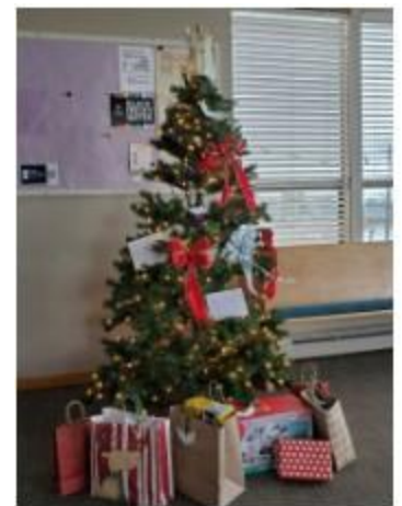
Gifts under the tree for the Christmas Joy program. Thank you for your love and generosity St. James!

For the adults at St. James during this season during worship, we will be using material from From Generation to Generation, A Sanctified Art LLC Advent devotional . It... "reminds us of the ways our lives, histories, actions, and stories are interconnected and woven together. The work of God is always unfolding-in and through us." Devotionals can be found in the narthex. We invite you to take a copy to use during this season of Advent.