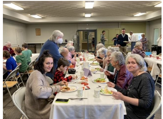
Photos from the Deacon's lunch on Sunday, Oct. 23