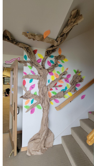
Photos from Creation Camp - Vacation Bible School July 2022