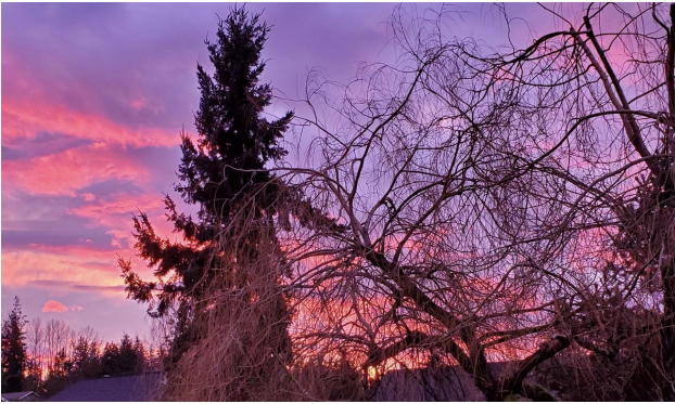
A winter sunset in Bellingham