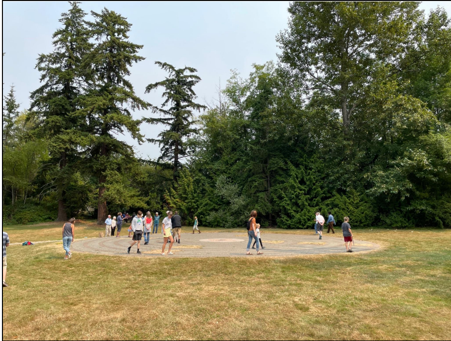
Walking the Fairhaven Park labyrinth at the 2021 Church Picnic