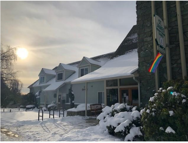
St. James Presbyterian Church