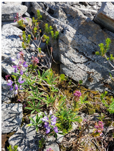
Wildflowers at Artist Point