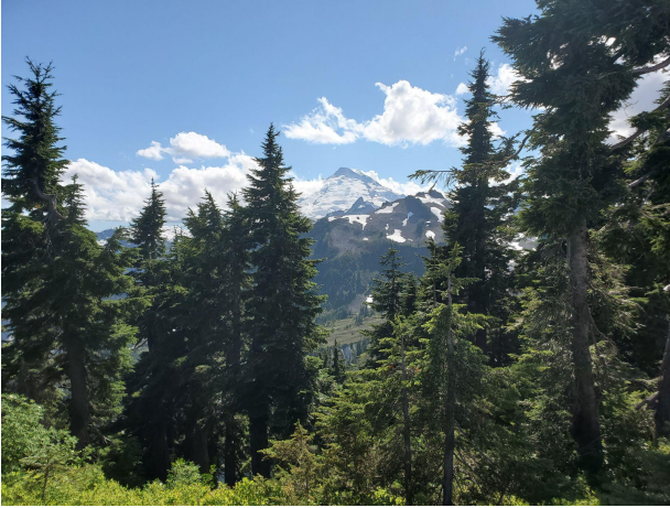
Hike to Artist Point