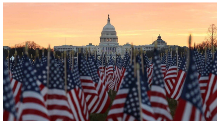
Presidents Day, February 15th

Interfaith Coalition of Whatcom County (in office)