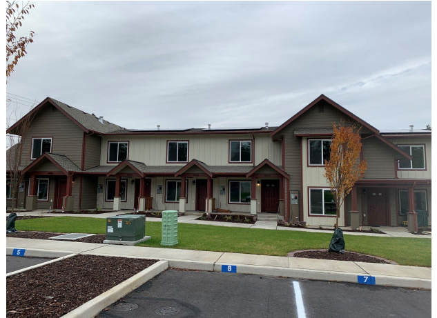
recently completed 8 new Telegraph Road townhomes - now ready for occupancy!