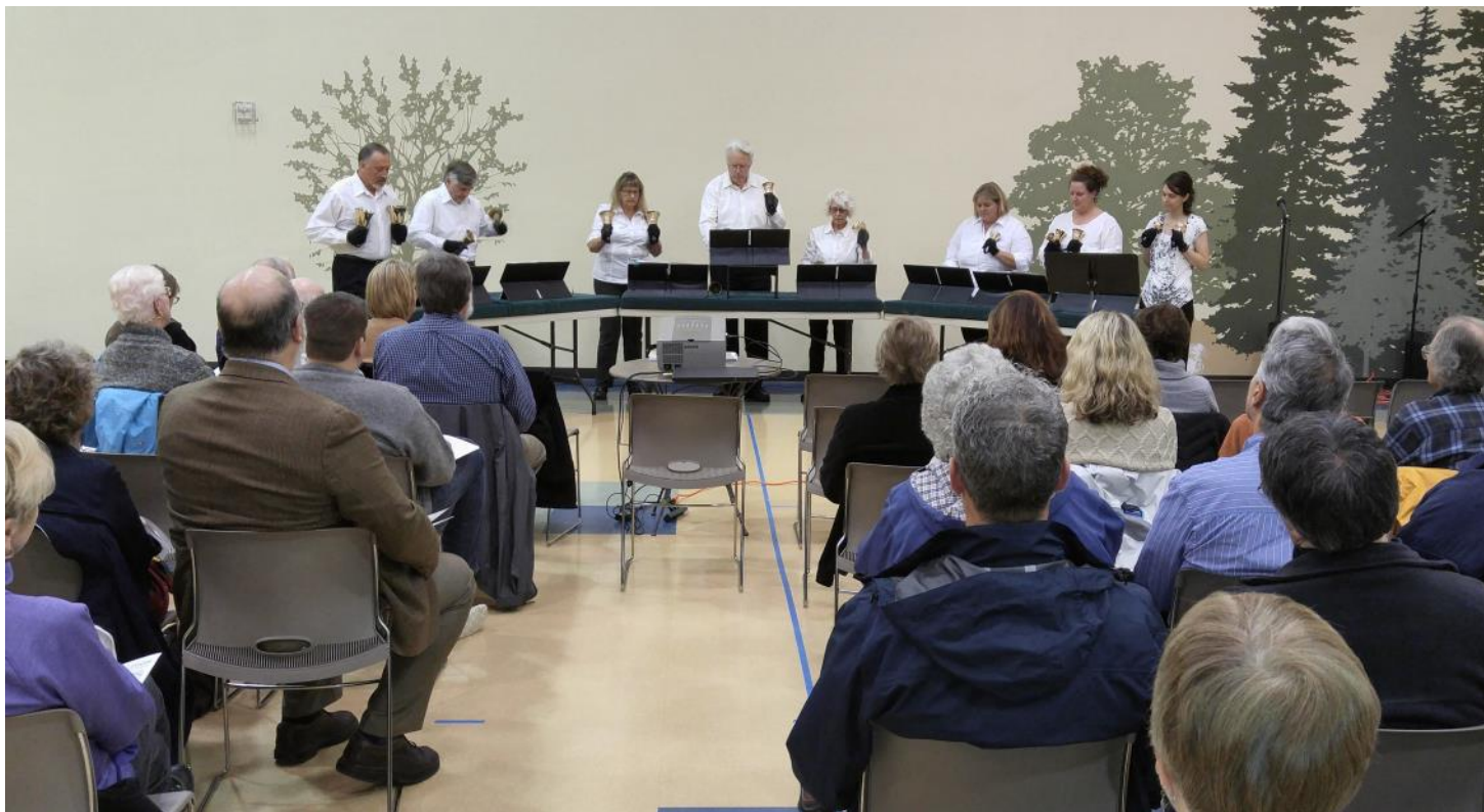
St. James Presbyterian Bell Choir