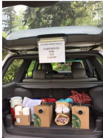
Labyrinth for the Earth coffee and tea stop