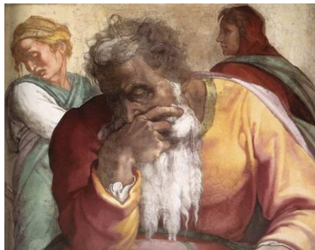
Prophet Jeremiah - Michelangelo

His suggestions? Among other things, he said we need to have honest conversations about how hard it