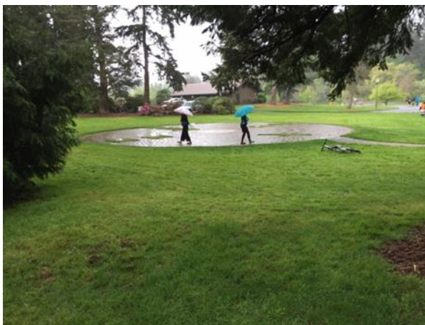
Labyrinth walkers at Fairhaven Park contemplate creation and our part in it.